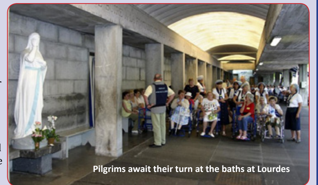
Pilgrims await their turn at the baths at Lourdes

May Mother Mary be the source of all charity and justice in our lives.